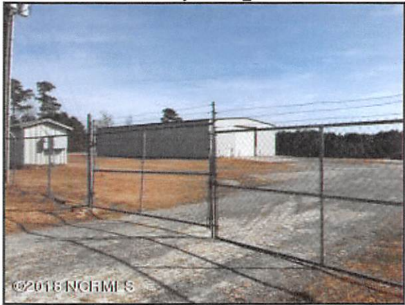
2473 Hwy 11 IMG_1397