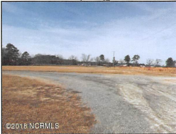
2473 Hwy 11 img_1398