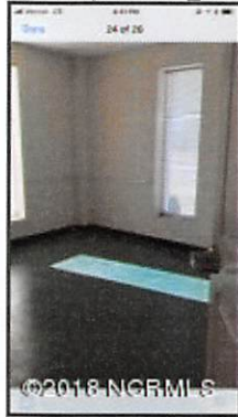
2473 Hwy 11 IMG_1325